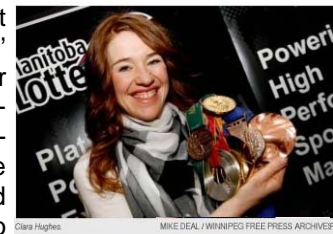
Clara Hughes