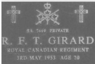
Wall Plaque, Wall of Remembrance