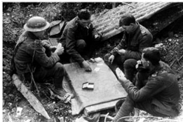
Cards anyone? Canadian soldiers take a break in the safety of a shell hole during April, 1917.