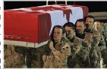
Canadian Forces Image Gallery