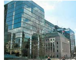
Bank of Canada Headquarters, from Wellington Street.

Contact Educational Program Reservations to book your FREE school visit today!