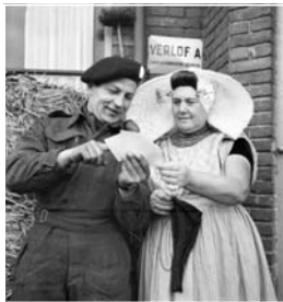
A Canadian Soldier Showing Snapshots from Home to a Dutch Woman

On All Fronts is divided into 7 sections: an introduction, 3 main thematic sections, as well as the See Everything, Hear Everything and For teachers sections. The brief introduction, WWII: An Overview in Moving Pictures , features films that give an overview of the war. The three main sections/