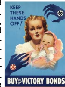
'Buy the New Victory Bonds' (WWII Poster)

themes are Many Voices, Many Stories ; The Home Front ; and Critical Perspectives . Each one is further divided into several sub-themes, each featuring a filmed interview or a written text by a specialist. Some of the sections offer a Vox Populi element where ordinary Canadians are invited to voice their opinions on the various aspects of World War II. These sub-themes also include excerpts from the NFB films, as well as other artefacts—photos ( left ), posters ( right ), sound excerpts, stock shots and drawings) and access to the complete films. The See Everything, Hear Everything gives users quick access to all of the Web site's films, archival artefacts and other audiovisual and textual contents. The For teachers section contains 8 lesson plans: 1 lesson will discuss issues around wartime propaganda and refer to NFB