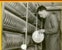
Propoganda: The Battle for Hearts and Minds