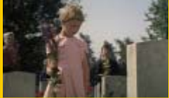
Fields of Sacrifice