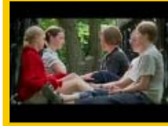
The Pacifist Who Went To War