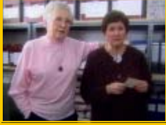
Rosies of the North